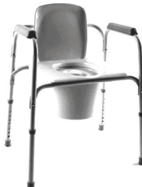
Standard bedside commode