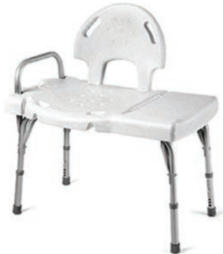
Tub transfer bench