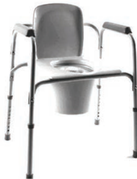
Standard bedside commode