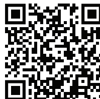
Survivorship Care Guidelines and Nutrition and Physical Activity Guidelines for Cancer Survivors