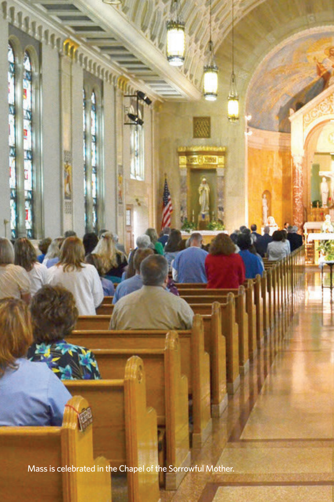
Mass is celebrated in the Chapel of the Sorrowful Mother.