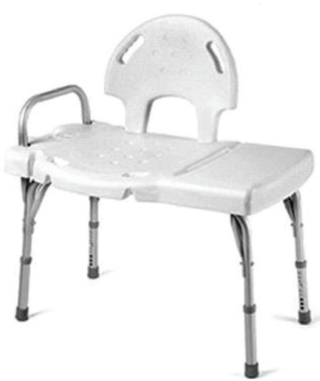
Tub transfer bench