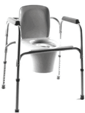
Standard bedside commode