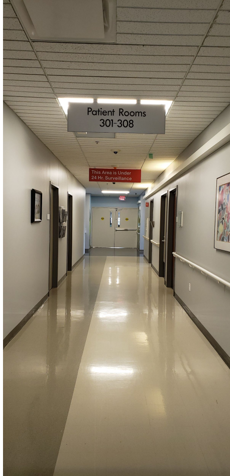
Entrance to Special Care Nursery